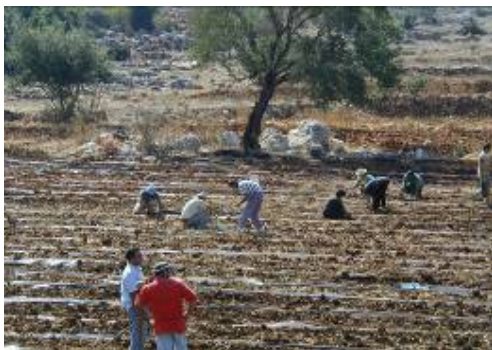
Thyme cultivation in Bint Jbeil, South Lebanon

Throughout and in the aftermath of the war, ESCWA monitored the needs of project participants. An assessment of the project, which was conducted after the war, revealed the resilience of the thyme plant and the eagerness of participants to rebuild the damaged parts of the project. Additional funds were accordingly provided for the rehabilitation of project infrastructure and dissemination lessons learnt from the model project to other villages in South Lebanon. Participants benefited from assistance in the area of marketing, including the design and printing of labels for the thyme packages, and production of a film about project activities.