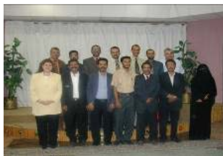
Members of the National Commission for Trade and Environment of Yemen and ESCWA consultants who contributed to its establishment

a. A workshop in Sana'a in May 2006, which targeted members of the National Commission for Trade and Environment. The Commission was established with the technical support of ESCWA, which drafted two studies to support the programme of work of the Commission for 2006. The first study deals with the legislative framework of trade and environment in Yemen, while the second deals with the fishing sector and ways of improving its competitiveness and sustainability;