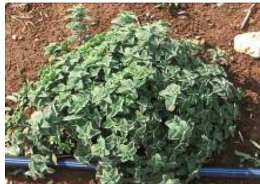
A thyme plant grown by the model project implemented in Bint Jbeil, South Lebanon